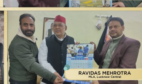
RAVIDAS MEHROTRA MLA, Lucknow Central