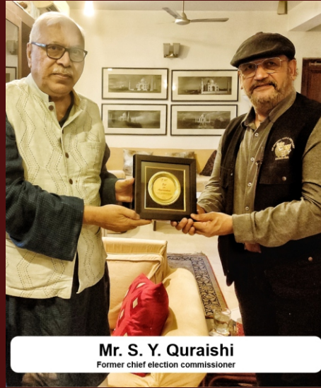
Mr. S. Y. Quraishi Former chief election commissioner