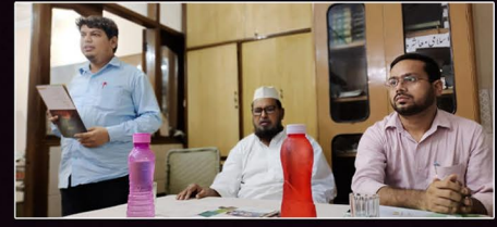
Meeting with partner organisations representative in Delhi regarding "Har Qadam Swatchhta ki Or"