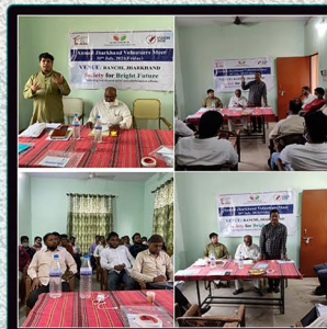
JHARKHAND ANNUAL VOLUNTEERS MEET