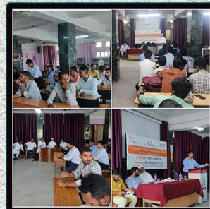
BIHAR ANNUAL VOLUNTEERS MEET