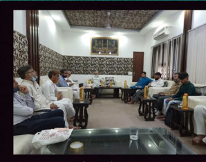
Meeting with 5 district representative from Haryana regarding "Har Qadam Swatchhta Ki Or"