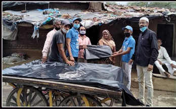
Tarpaulin distribution program in Ujjain, Madhya Pradesh