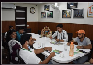
Meeting with Authentic Foundation regarding Har Qadam Swatchhta ki Or