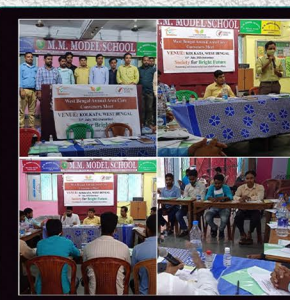
WEST BENGAL ANNUAL VOLUNTEERS MEET