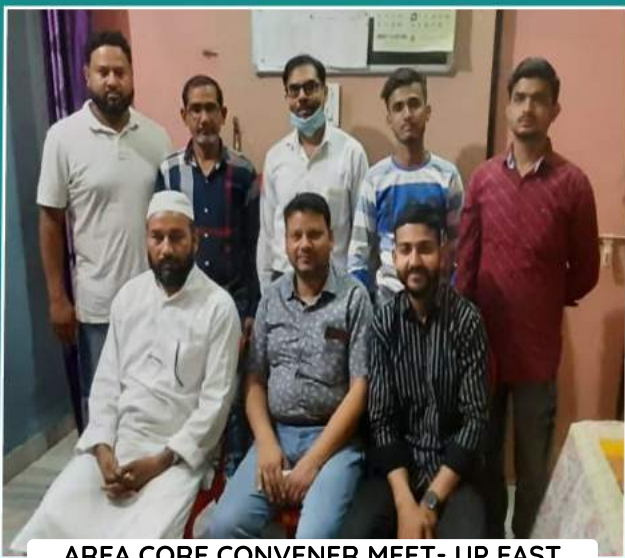
AREA CORE CONVENER MEET- UP EAST