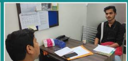
MEETING WITH FEED THE NEEDY