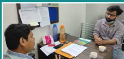
MEETING WITH BLESSING NGO