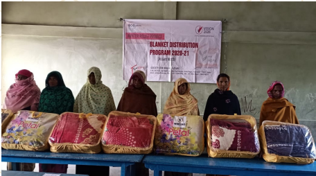
Assam - North

In the freezing nights of December & January, when the entire Country owns their sweaters, monkey-caps, and mufflers with a hot cup of tea but there are few under-privileged who cannot afford even a blanket. So, Society for Bright Future has started a blanket distribution program. We have distributed 17,000 blankets across the Country to the needy once.