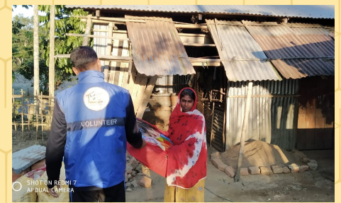
Assam - South